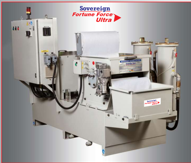
Sovereign Fortune Force Ultra Intelligent High Clarity High Force Coolant Delivery System with Automated Coolant Controller

Scientifically, the selection of Coolant, its Concentration, Volume & Delivery Pressure for High Speed Machining are dependent on: